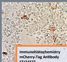
Immunohistochemistry mCherry-Tag Antibody STJ34373