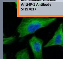
Immunofluorescence Anti-IF-1 Antibody STJ97037