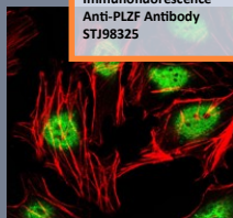
Immunofluorescence Anti-PLZF Antibody STJ98325